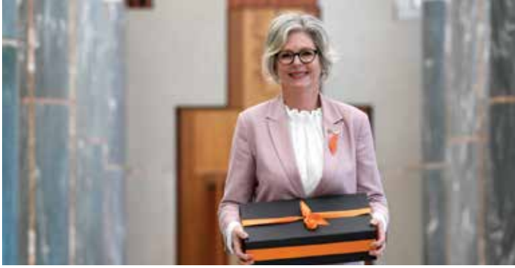
SIGNED UP: On the way to present the petition from more than 1800 people calling for a federal integrity commission that upholds the Beechworth Principles.