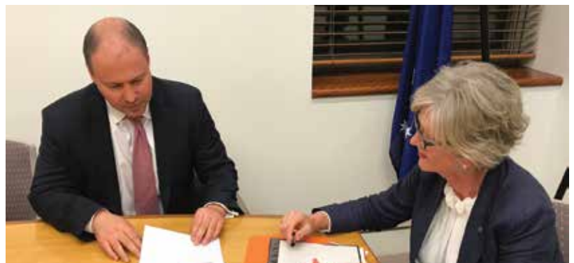
TABLED: Talking with Treasurer Josh Frydenberg about my COVID-19 Indi small business survey report on May 14.