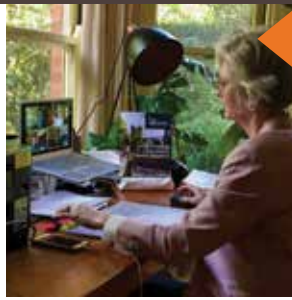
AGE-FRIENDLY: Launching the disaster recovery report by video-conference

Responding to coronavirus has made telehealth more accessible. You can now have a consultation from home via phone or video. I discussed the practicalities on a video-call with North East Family Medicine in Wangaratta. Seeing a doctor face to face in rural and regional Australia can be complicated by travel times and poor public transport. Telehealth is a great alternative. It's covered by Medicare for a range of services. These include mental healthcare, chronic disease checks, health assessments, pregnancy support, and aged care facility or after-hours consultations.